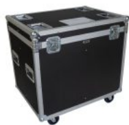
PROJECTOR CASE 4