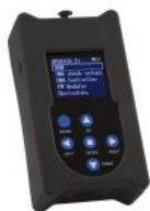
FIRMWARE UPDATER 2+