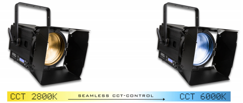
CCT 2800K SEAMLESS CCT-CONTROL CCT 6000K