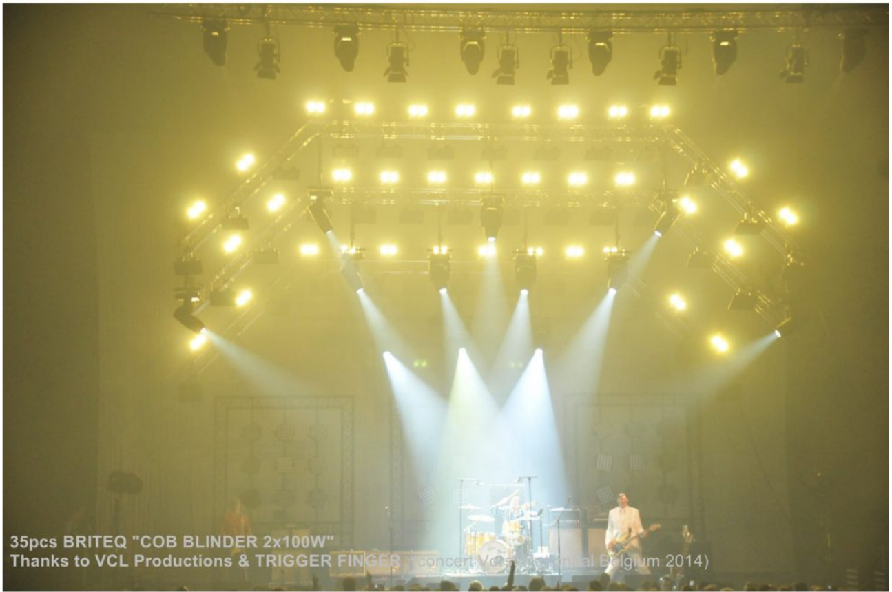
35pcs BRITEQ "COB BLINDER 2x100W" Thanks to VCL Productions & TRIGGER FINGER (concert Voorsymposiumaal Belgium 2014)