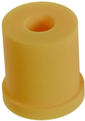
x 6 M25 4 - 8 mm